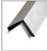
Stainless Corner Guard F560SS