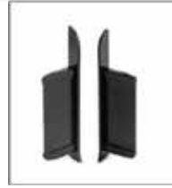
End Caps M625 RH M620 LH