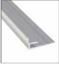
Inside Corner A550