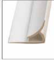
Inside Corner M350