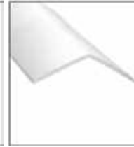
Outside Corner V179 135°