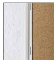
Staple division molding to subwall along resealed edge.