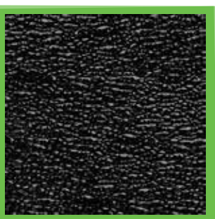
P 807 Black Class C

Approved by Canadian Food Inspection Agency and Agriculture Canada.