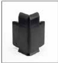
Outside Corner M660