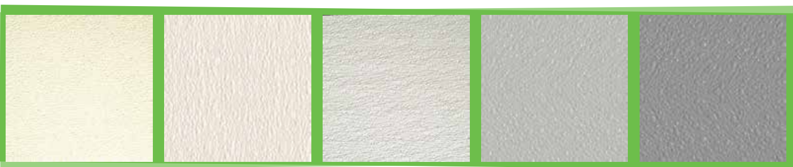
P 140 Ivory Class C* Class A