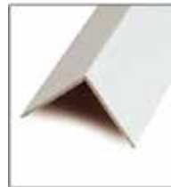
PVC Outside Corner Guard M961