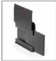
Butt Joint Connector Included with Base Molding Strips