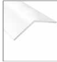
Inside Corner V177 135°