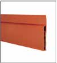
PVC Base Molding 4" wide x 10' long