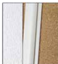
Slide division molding under edge of first panel.