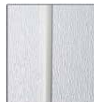
Adhere second panel in place and repeat.