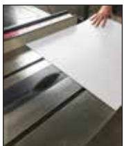
FRP Panels can be easily cut with a table saw.