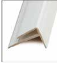
Outside Corner M360