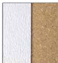
Adhere panel to subwall.