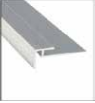
Outside Corner A560