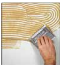
Apply Marlite Brand Adhesive to the back of panels and apply them to a subwall.