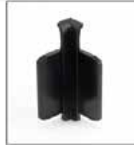
Inside Corner M651