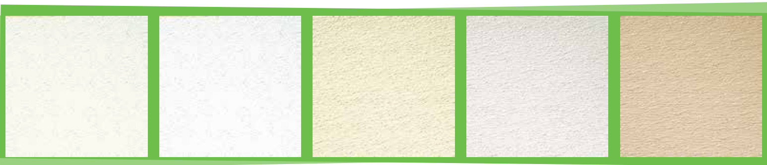
P 100 White Class C* Class A*