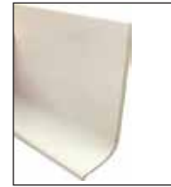
Base Cove V65 3"