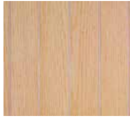
324-S2 Laredo Oak