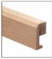
WG 475 Small Chair Rail