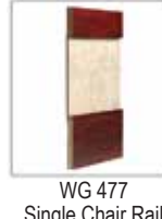
WG 477 Single Chair Rail WG 1261 Base Molding