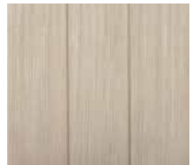
5408-S4 Monterey Sand