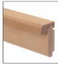
WG 474 & WG 475 Single Rabbet Chair Rail as Cap