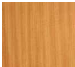
319 Whittier Anigre