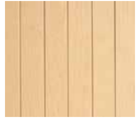
310-S2 Sierra Maple