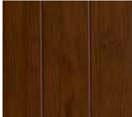
463-S4 Eastern Walnut