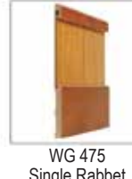
WG 475 Single Rabbet Chair Rail WG 1261 Base Molding