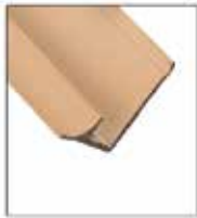
M 451 90° Inside Corner