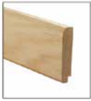
WG 477 Large Chair Rail