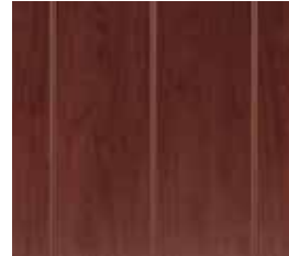
791-S4 Wild Cherry