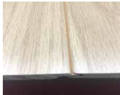
Almost Seamless Design* Requires no visual fasteners*

Great color control No jobsite sanding, staining, or painting required.