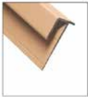
M 460 90° Outside Corner