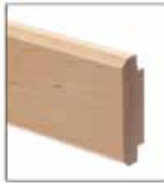
WG 474 Double Rabbet Chair Rail