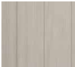
5345-S4 Coastal Silver