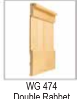
WG 474 Double Rabbet Chair Rail WG 475 Single Rabbet Chair Rail WG 1261 Base Molding