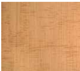
148 Monticello Anigre