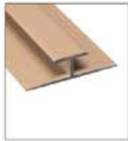
M 465 Division (for use with panels)