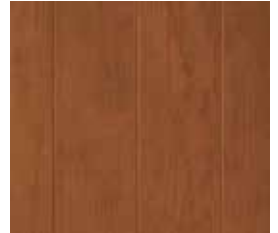
925-S4 Autumn Cherry