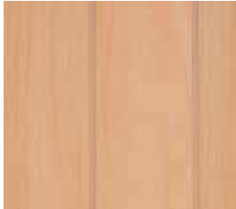
317-S4 Alum Rock Maple