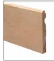
WG 1261 Base Molding