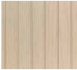
323-S2 Plantation Oak