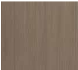
5344-S4 Willow Bark