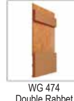
WG 474 Double Rabbet Chair Rail WG 1261 Base Molding