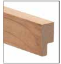
WG 2620 Edge Molding