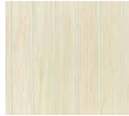
329-S2 Novato Oak