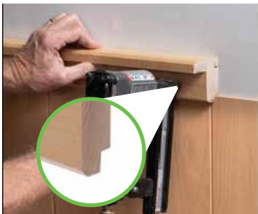
Moldings are easy to apply

Outstanding Durability Moisture Resistant