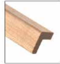
WG 1647 I/O Corner Molding