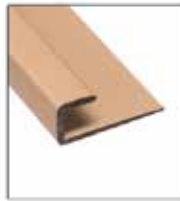
M 470 Edge