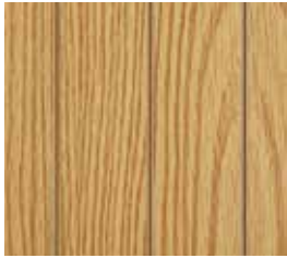
321-S2 Natural Oak