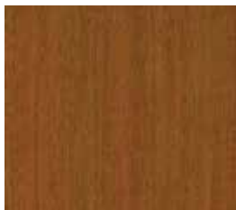
318 Windsor Anigre